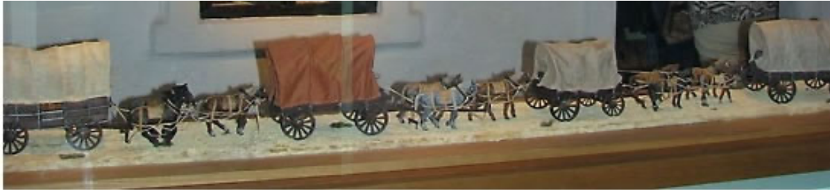
The trek of the Swiss colonists in the museum of Schabo