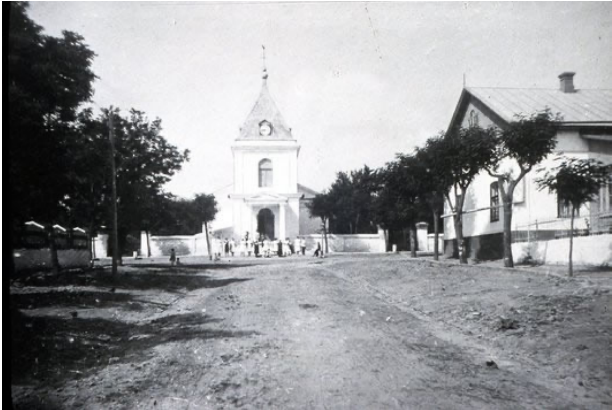
The church in Schabo around 1922