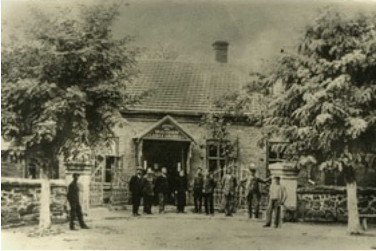
In 1822, a group of Swiss followed the call of the Russian Tsar Alexander, who promised them a better life on the Black Sea

On July 21, 1822, the first convoy of Reformed French-speaking Swiss from Vaud set out on a 2,500-kilometer journey across Europe.