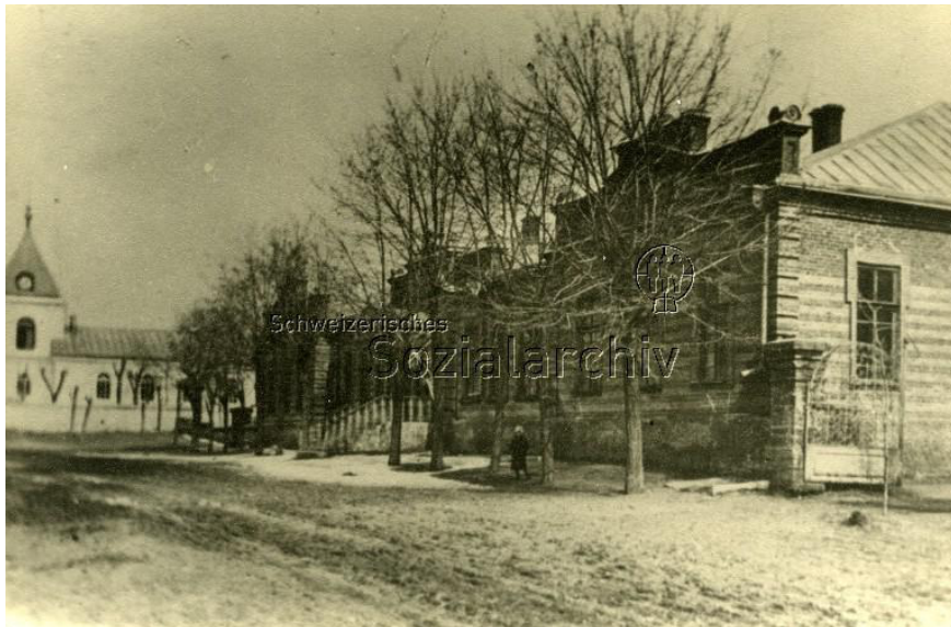
School in Schabo

Due to the German colonists, there were now not only two languages, but also two denominations represented in the colony.