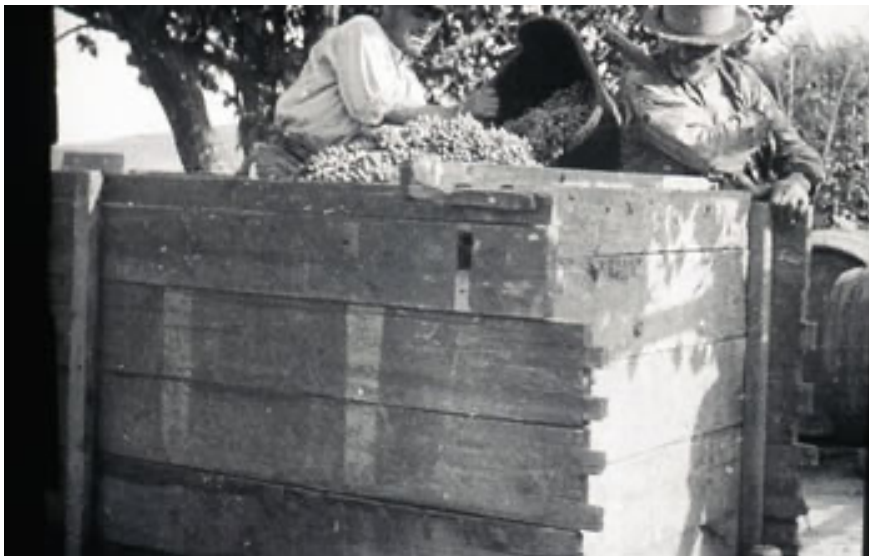
Grape harvest in Schabo around 1950

In 1829 the Swiss produced 3,480 , in 1848 11,640, in 1871 65,000 and in 1872 92,000 buckets ( 1 bucket equals 12 liters) of wine. At the end of the 1840s, the Schabo winegrowers employed 3,200 seasonal workers.