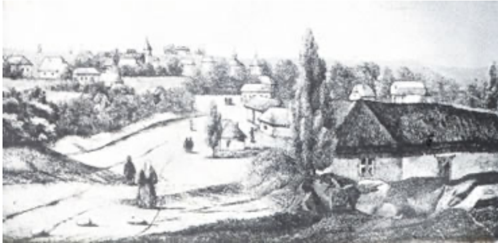
Schabo around 1850